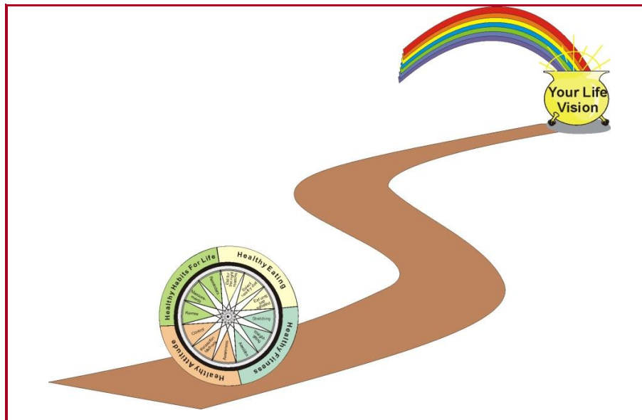
Figure 2 Road to Optimum Health

Think about what you want your life vision to be. Make it something that will continually draw you forward through the coming years. Write it down on a piece of paper and put it away in a safe place (not so safe that you forget where you put it!) Every so often you should look at it to see how you're doing in your pursuit of your vision.